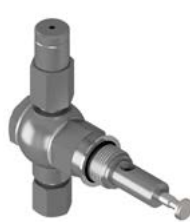
PE 120 V PLV Max. 0.12 cc/stroke Adjustable output