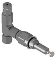
PE 60 PLV 0.06 cc/stroke

Three pump elements with different flow rates are available, as well as a flow-adjustable pump element. All pump elements are marked either with a groove or with a notch for a better differentiation.