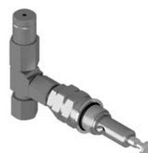
PE 170 PLV 0.17 cc/stroke