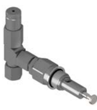
PE 120 PLV 0.12 cc/stroke